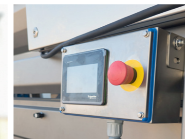
movable roller sorter frequency controlled and adjustable