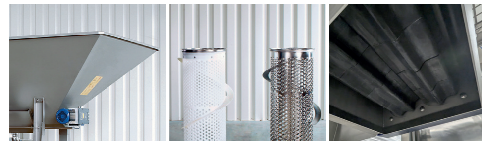
large infeed hopper with extension of auger