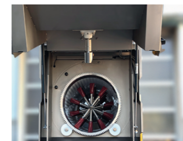
destemming shaft and basket separated, frequency-controlled and adjustable