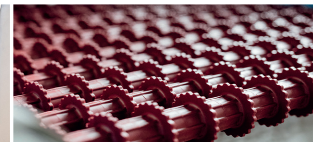
open and closed rollers are separately adjustable in spacing